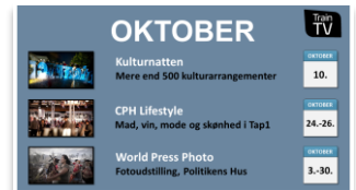
Image - vertical/upright - minimum 500 pixels high

Description - max 300 characters incl. space (incl. time, place, website)